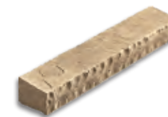
Rock Face Sill 19.75"W x 3"D x 2"H (FACE) TO 2.5"H (BACK)