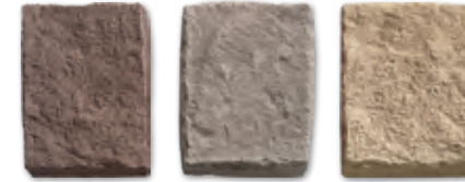
Espresso Grey Cream

StoneCraft accessories are designed to provide the finishing touch to any stone veneer application. Developed specifically to work in concert with any of our profile colors, each accessory is offered in four versatile colors.