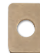
Light Box 8"W x 11"H x 1.5"D