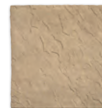
Hearthstone 19"W x 20"L x 1.5"H