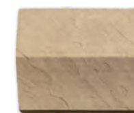
Peaked Wall Cap 20"L x 12"W x 2.375"-3.5"H 20"L x 16"W x 2"-3.5"H