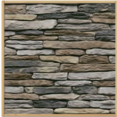
Pennsylvania Laurel Cavern Ledge