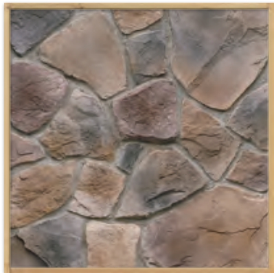
Valley Forge Fieldstone