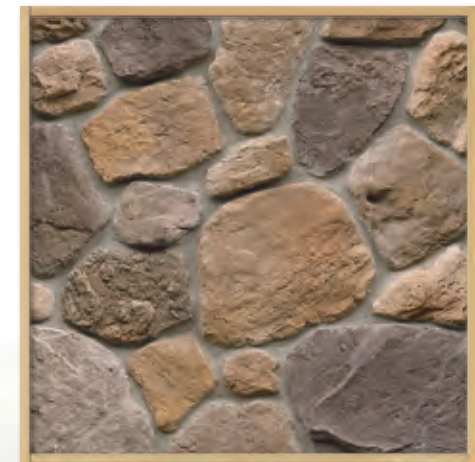
Warm Springs Top Rock