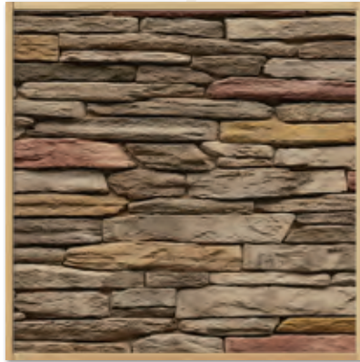
Chardonnay Laurel Cavern Ledge