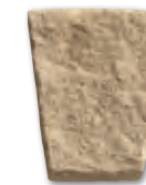
Keystone 8"-5.5"W x 10"H x 1.5"D