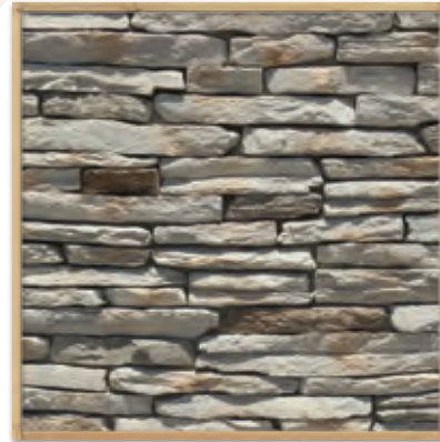
Hamilton Laurel Cavern Ledge