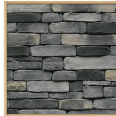
Kingsford Grey Ledgestone