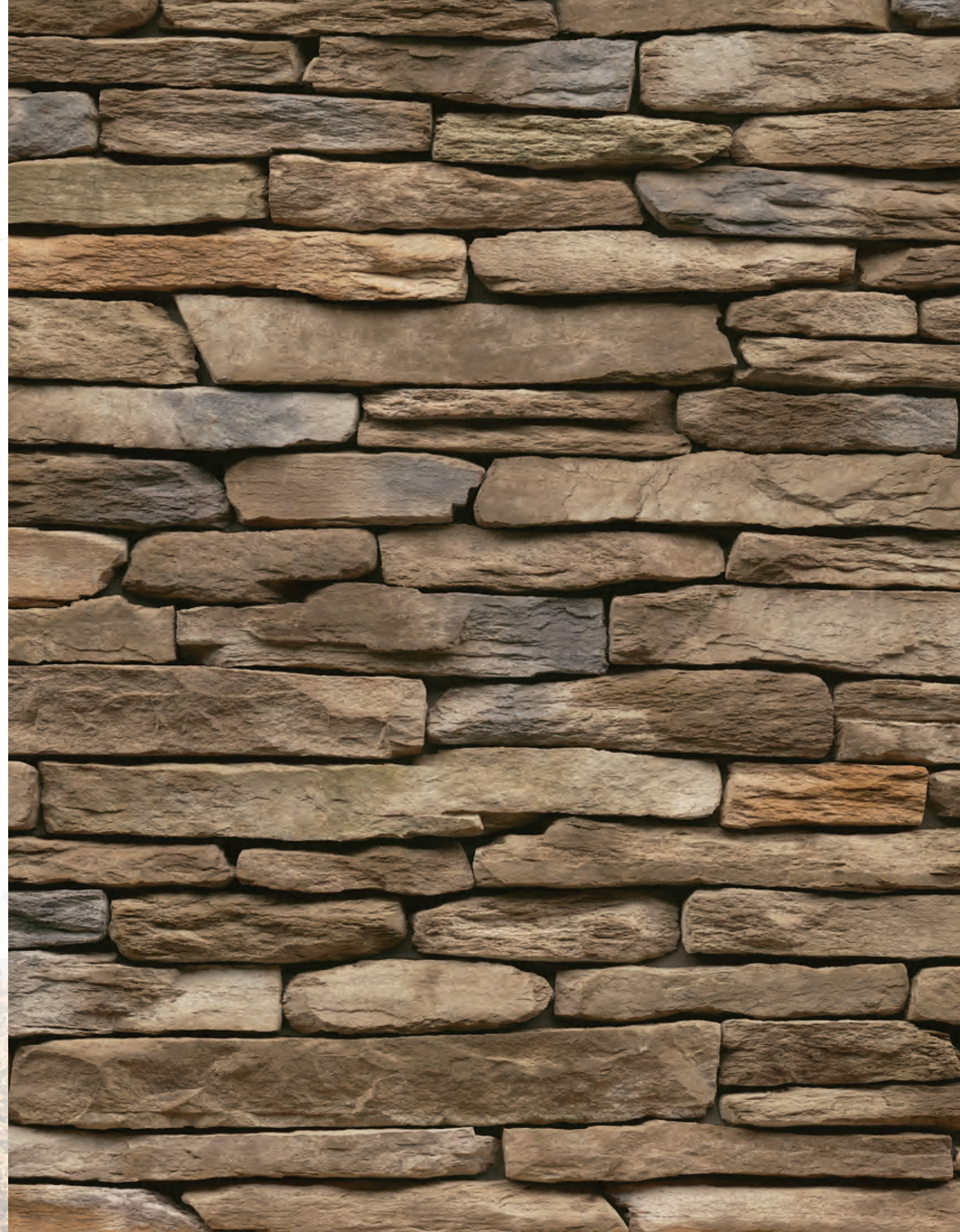
Asher Laurel Cavern Ledge