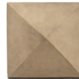
Pier Cap 26"W x 26"L x 2.5"-5.5"H