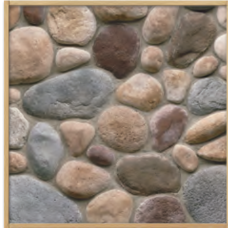
Adirondack River Rock

The distinctive and time honored shape of River Rock is easily recognizable. Soft rounded contours are slowly revealed from the gradual effects of rushing water. River Rock ranges in size from approximately 1½"-15" in height and 3"-18" in length.