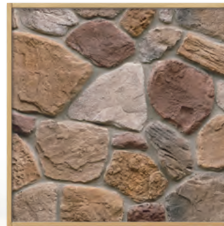
Realen Top Rock