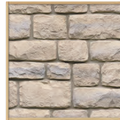
Old Ohio Heritage