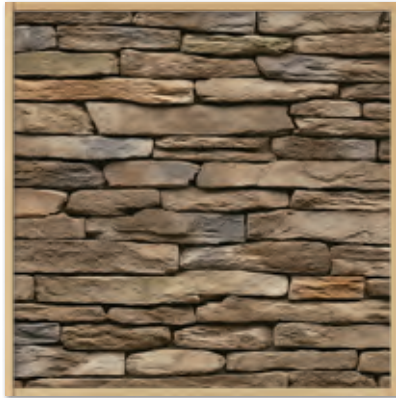
Asher Laurel Cavern Ledge