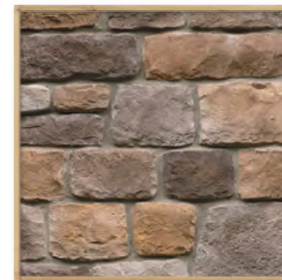
Warm Springs Heritage