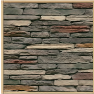
Tennessee Laurel Cavern Ledge