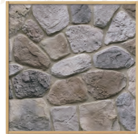
Pennsylvania Top Rock