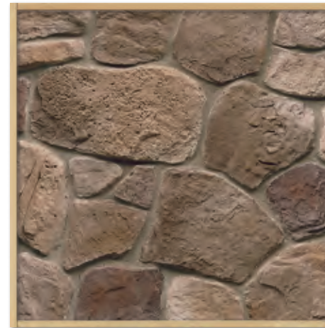
Brown Top Rock