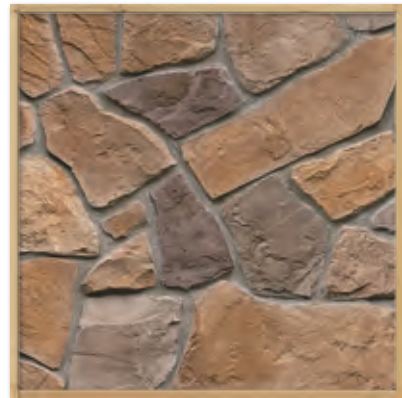
Warm Springs Fieldstone