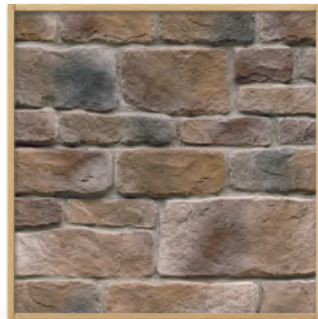
Valley Forge Cobble